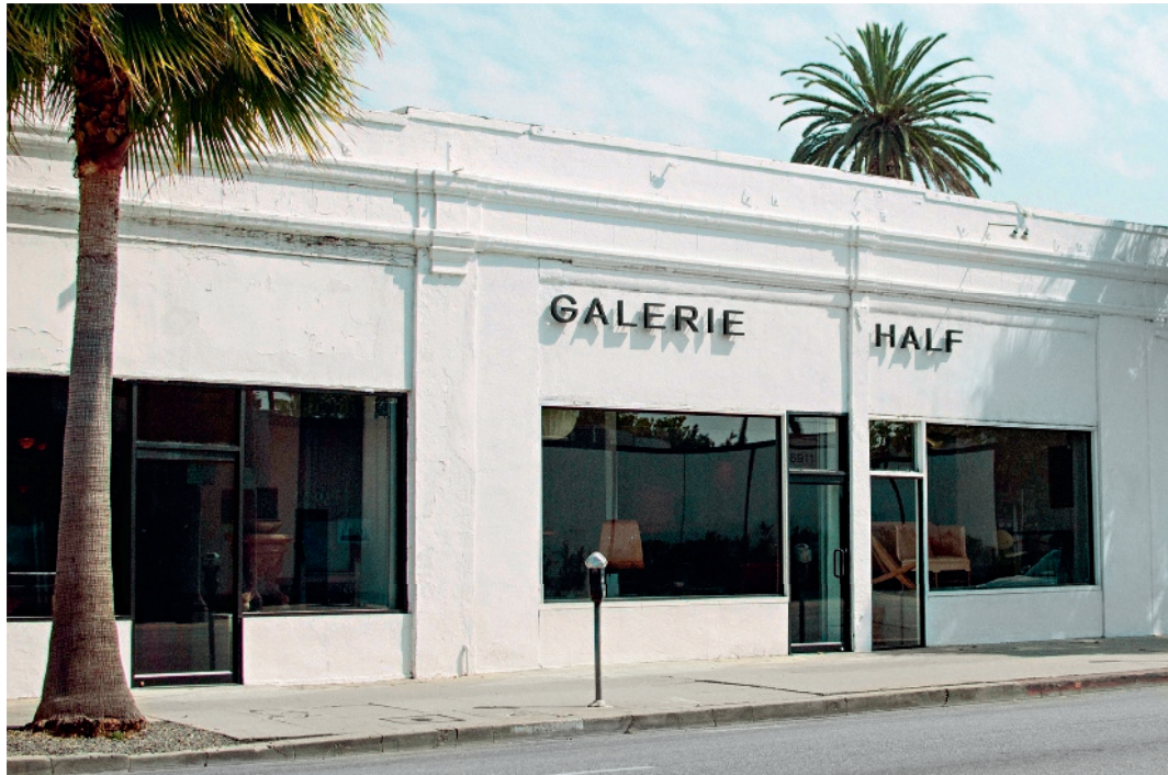
6911 MELROSE AVENUE